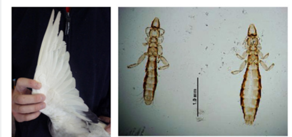
Figure 3: Clinical examination with detection of ectoparasites ( Columbicola columbae ) in pigeons.