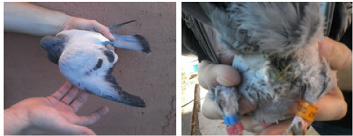
Figure 4: Clinical symptoms of infected pigeon with Salmonellosis spp. -joint form.

Note: Clinical examination of the dove showed palpable feathers, reluctance to fly, weakness, mild dehydration, swelling of the humero-ulno-radial joints with stained cloaca with yellow-green faeces. After unsuccessful treatment with chloramphenicol, an autopsy was performed with sampling for culture and pathogen confirmation.