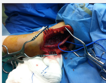
Figure 2: Intraoperative view of the ulnar nerve after full excision of the tumor.

A nuclear palisading pattern was focally observed in the tumor. Typical Antoni B areas were also observed in the tumor. Expression of S-100 was found in some of the cytoplasm. SMA, desmin and CD117 tests were all negative. CD34 was positive only for the vascular endothelial cells. The Ki-67 proliferation index was less than 2%. Morphologically, the tumor consisted of typical Antoni A and Antoni B areas, which are generally found in schwannomas but not in neurofibromas, and immunohistochemistry results revealed a Schwann cell origin of the tumor cells. These features established the diagnosis of schwannoma. At the first postoperative day the patient had a numbness of the ulnar nerve distally of the excision but no motor defects. At 6 months follow up the wound is well healed with no tenderness upon palpation. No motor deficit is observed. The patient returned to full labor work as a lawyer and is satisfied with the outcome.