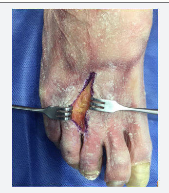
Figure 2: Cadaveric Representation.

cauterized. Meticulous hemostasis is off the utmost importance. We do recommend using a pneumatic tourniquet [14] (Figures 2 & 3).