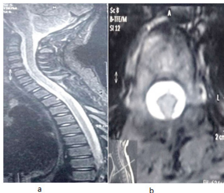
Figure 2: Cervico-dorsal spine postoperative MRI images T 2 sagittal (a) and T 2 axial (b) at D1-D2 level show complete removal of the abscess with complete cord regeneration.

The patient started to have some movements in his legs from day 5. The leg strength continues to improve steadily. One month later, the child was able to move his legs spontaneously but still had visible residual weakness. Antibiotics ceased after 2 weeks and he was sent for neuro-rehabilitation. The postoperative MRI spine revealed a full resolution of the abscess and the regeneration of the cord was almost complete. The child displayed a significant neurological improvement on the regular assessment as an outpatient for nearly 11 months and now he is playing football (Figure 2).