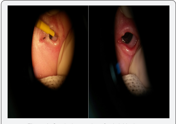
Figure 2: Surgical correction of ankyloblepharon.

Dermatology consultation recommended topical streoids in scarceeczematous areas and daily mineral ointments. Later hair prosthesis was discussed with the parents. Surgical correction of ankyloblepharon was carried out by ophthalmologists. Tearing of lid bridges was done in the operating room, under general anesthesia, using an electric scalpel in both eyes (Figure 2-Surgical correction of ankyloblepharon). Careful tearing with gentle pulling of the eyelids was carried out in order not to damage the underlying cornea. Post-operative period had no complications and after 12 months of follow-up lid edges are completely free (Figure 3 - After 12 months of follow-up).