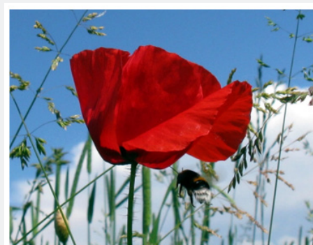
Photo of poppy and bee by the author

it eventually became a crutch to carry people through their daily life [1,2]. Compounding this inadequate answer to a problem is the fact that dependency on the escape or mask becomes addictive. Worse, whatever the trouble the person wanted to avoid becomes more difficult and they enter a downward spiral Figure 1. Archaeologists investigating the Neolithic ages, 7,000 years ago, found poppy seeds used medicinally. Before the poppy is ripe, the seed pod can be cut to allow a latex to ooze out and be collected. Observe babies, they put everything in their mouth. Little imagination is required to accept that humans discovered the use of the poppy as an anesthetic. Poppies are the raw material for opium from which heroin, methane, codeine and thebaine are derived and the synthetic forms of oxycodone, hydrocodone, hydromorphone, and other semisynthetic opiates.