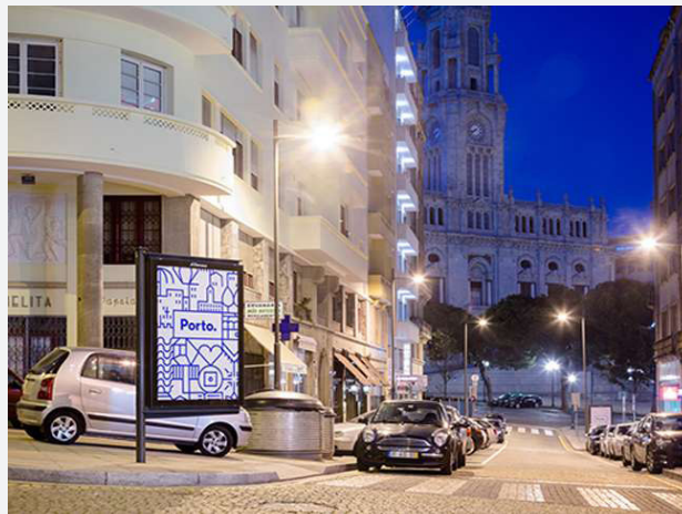
Figure 14: The new identity of Oporto (2014).