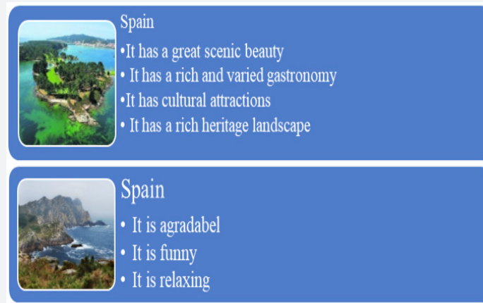
Figure 16: The image of a tourist destination is part of its identity.

Just as it is fundamentally to understand their formation, it is crucial to understand the components of the image. The image of the tourist destination is formed by three different components [9], but hierarchically related (Figure 15). The cognitive component, also called “perceptual” or “intellectual”, is the result of the image and attributes of the tourist destination that has the capacity to attract tourists (Figure 16). It is a dimension of interpretation of the characteristics of the destination that includes the information that contributes to the knowledge about the destination, or in summary, it is what the individual thinks or thinks he knows about the destination.