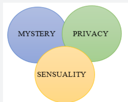
Figure 4: Ingredients to get lovemark.