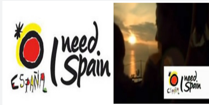
Figure 8: Spain Brand campaigns.

the reflection of the perception that all the agents that are part of its environment have on the country: real and potential tourists, private sector, media, etc., so that its good positioning is crucial to carry out the promotion of destiny successfully. That is why this is one of the most important objectives of the Tourism Institute of Spain: achieving an optimal positioning of the tourism brand in Spain, collaborating with the rest of the public bodies in charge of ensuring the rest of the dimensions of the brand. In 2002, the first project of the Spain brand was launched with the Joan Miró sun as logo and clear objective, to enhance the image of Spain in a coordinated way. This is demonstrated by the advertising campaigns of Tours pain that have taken place over these years. In addition to the legendary 'Spain is different' of the 80s, which despite the time elapsed is still linked to this country brand, since 2002 other slogans such as 'España Marca' ('Spain Marks') resonate in 2003; ¡Sonríe, estás en España! ('Smile, you are in Spain! linking it to different types of tourism, Figures 8 & 9), in 2005; or 'I need Spain', in 2010.