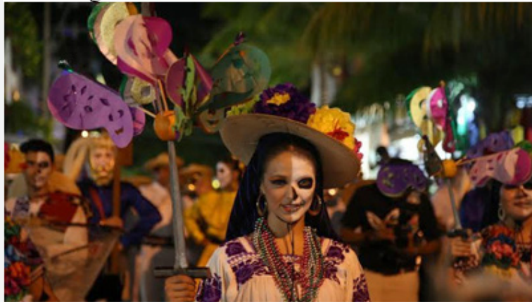
Figure 5: Life and Death Festival in Xcaret.

Tourists of all nationalities flood the park, painting the faces of skulls to witness stories, traditions and shows that revolve around the grim reaper and its mystery (Figure 5).