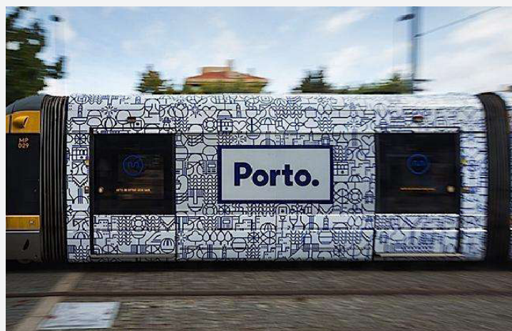
Figure 12: The new identity of Oporto (2014).

In the first component, identity, we speak of perceptions, these being an important ferment for two successive tourist destinations, a time that competitiveness between the destinations depends on how this tourist hair is perceived, mainly at the level of quality, prestige e brand image. The large number of tourist destinations