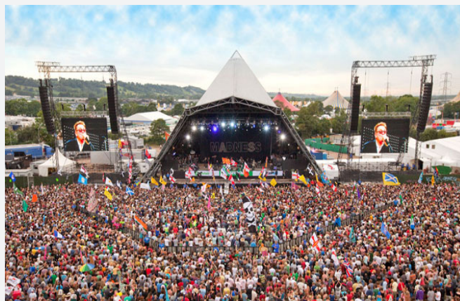
Figure 6: Glastonbury Festival (UK) and FIB (Spain)

sex, nationality or preferences. The Riviera Maya breaks paradigms of segmentation; it is a paradise with which anyone could feel identified; all are welcome to meet from the cosmopolitan 5 th avenue in Playa del Carmen to the thematic hotels like the Hard Rock or luxurious like the Grand Velas.