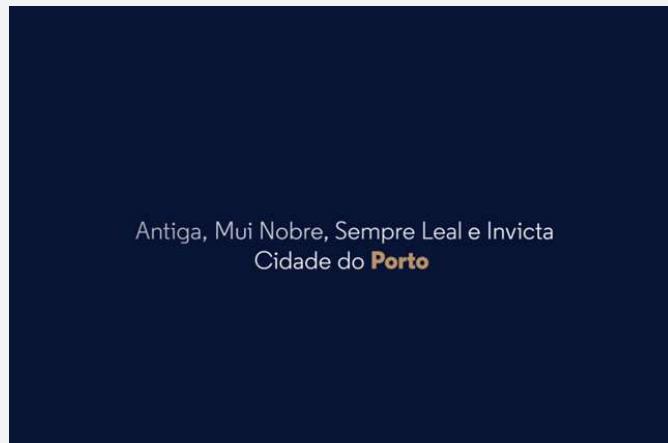
Figure 11: The new identity of Oporto (2014).