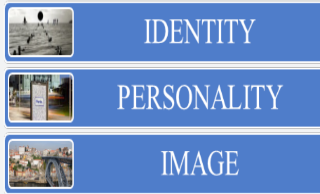
Figure 10: Destination branding components.