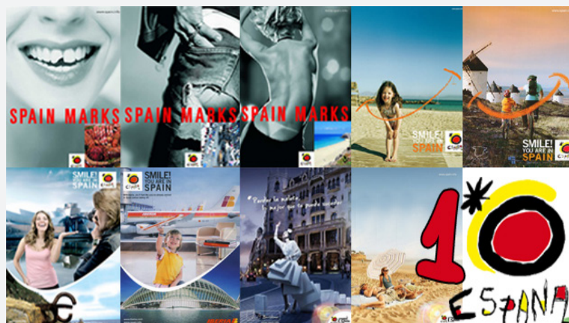
Figure 9: Spain Brand campaigns.

A brief analysis of the evolution of this concept shows that destination branding has evolved accompanied by other related concepts. Mainly from the term place promotion, which groups a set of techniques for the promotion of the territory abroad. This concept has given rise to the notion of place marketing, which brings together the strategies of development and planning of the territory. Subsequently, the concept of place branding arises, which groups the values and attributes of the territories,