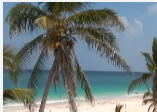
Figure 3: Riviera Maya promotion campaign 2012.