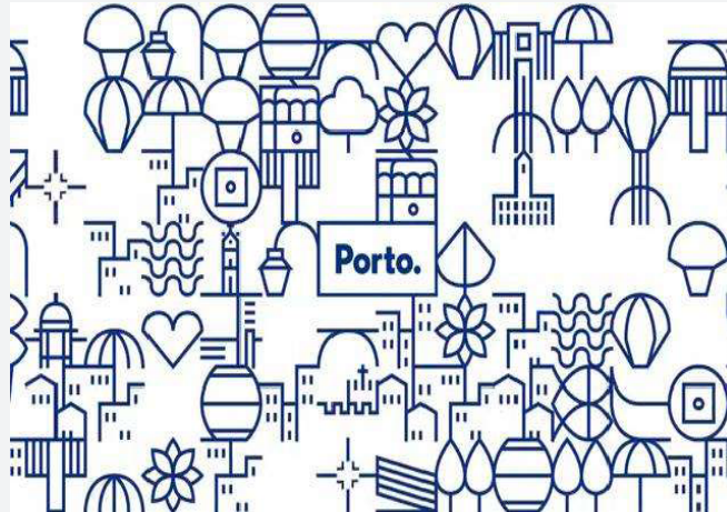
Figure 13: The new identity of Oporto (2014).

new identity wanted to give the city a strong personality, using a clear message in the form of a simple and endless network of symbols. Oporto has a great personality that, thanks to this system or open language, can be developed in an almost unlimited way with the possibility of new communicative and touristic projects (Figures 11-14).