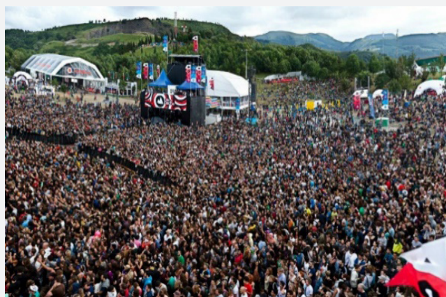
Figure 7: Glastonbury Festival (UK) and FIB (Spain).