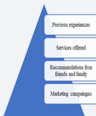
Figure 1: Factors that make up the TDI. Source: Dias and Cardoso [5].

These three definitions cover a very long-time period, from the end of the 70s to the current decade. But all of them are based on the same idea, the mental representation that the tourist makes of a destination, whether it is the result of his impressions, experiences, ideas, beliefs or the attributes of destiny. The most recent theories group a series of factors whose union arises that mental representation (Figure 1).