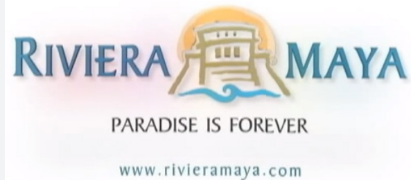
Figure 2: Riviera Maya promotion campaign 2012.

today is one of the most important destinations in Mexico with a large international influx, and all this in less than 20 years. In its promotional video of 2012 it emphasizes its culture, history, location, nature, population and tourist places together activities. It is a tourist destination with a great combination of varied resources, with its promotional slogan "Paradise is forever" (Figures 2 & 3).