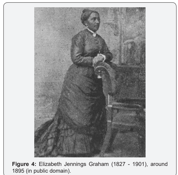
Figure 4: Elizabeth Jennings Graham (1827 - 1901), around 1895 (in public domain).