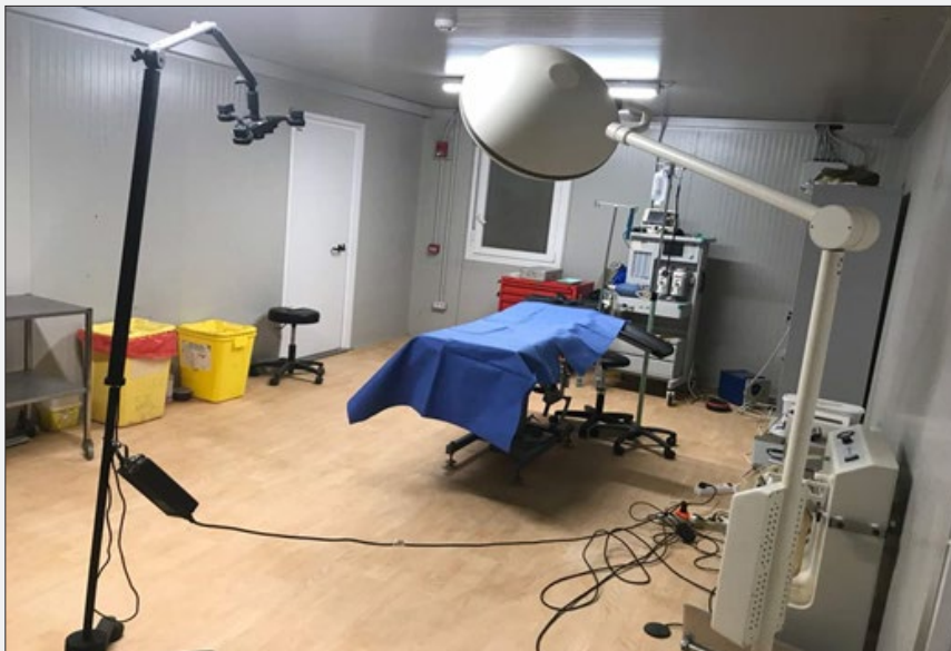
Figure 2: Operating room TGLV2 Hospital.

a) The operating room (Figure 2) had two operating tables that can be used simultaneously when needed. The sterilization equipment was constituted of two autoclaves and two dolls.