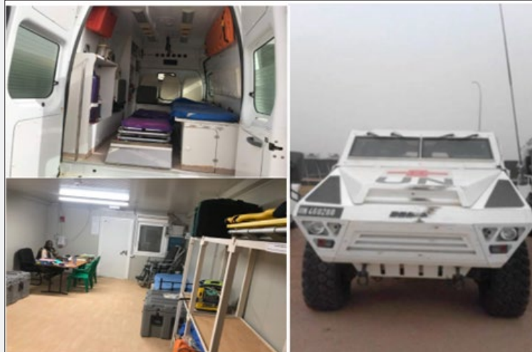
Figure 3: Aeromedical evacuation team materials.

d) The AMET has two ambulances equipped for emergency care and several emergency kits (Figures 3).