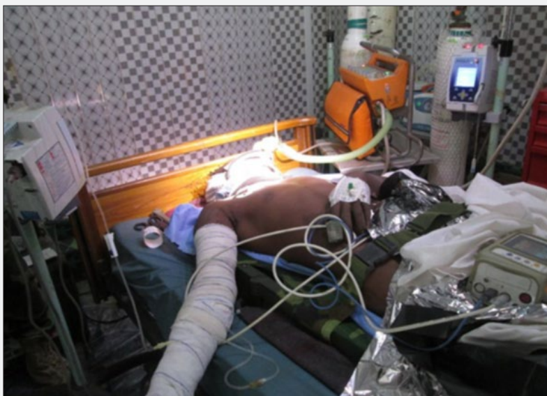
Figure 5: 28-year-old soldier on resuscitation.