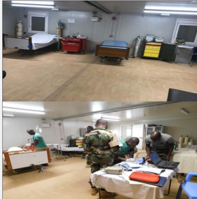
Figure 1: Resuscitation room.

surgical care to casualties before their evacuation to a higher-level hospital. For this purpose, the hospital had a resuscitation unit (Figure 1), an intensive care unit, an operating room, a radiology unit, a laboratory, and an aeromedical evacuation team (AMET).