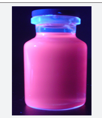
Figure 4: Red pink urine on Wood's light examination.