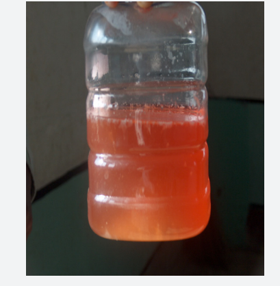
Figure 3: Dark urine of the patient.